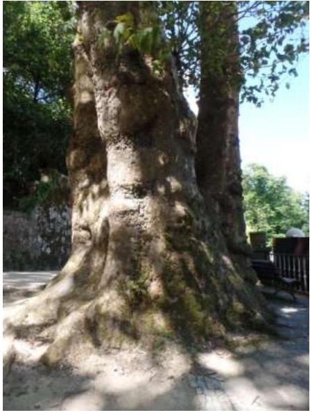
Platanus x acerifolia D. G. 290 II Série 18/12/51 Parque da Liberdade

Formerly known as Parque Municipal Valenças