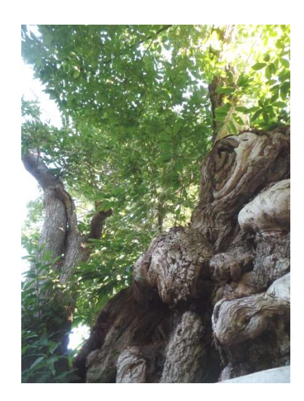
Castanea sativa Miller – D. G. 70 II Série 26/03/45

Quinta do Castanheiro – Caminho dos Frades