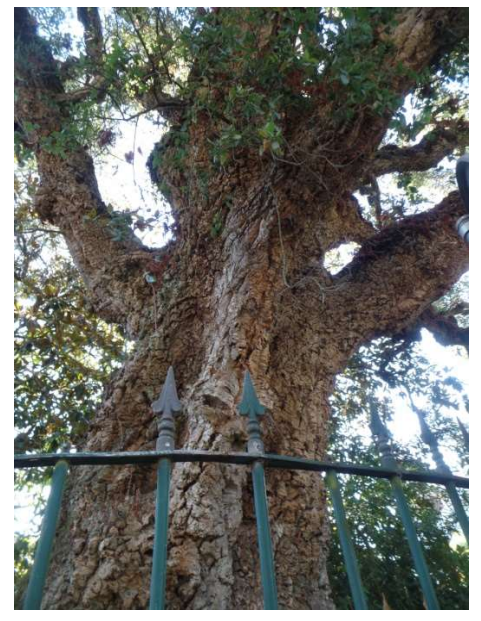
Quercus suber – Sobreira dos Fetos – D. R. 276 II Série 28/11/96 Quinta do Relógio Largo da Quinta do Relógio

"There lies herein a tree which is so large that a painter should come out from England just to see it. Its trunk and branches are covered with ferns which form the most picturesque contrast with its dark foliage" in the words of the English poet Robert Southey (1774 – 1843)